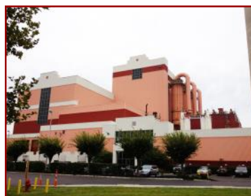
Covanta - Camden Facility

To organize a tour at one of Covanta's New Jersey facilities or to learn more about the company, please visit www.covanta.com .