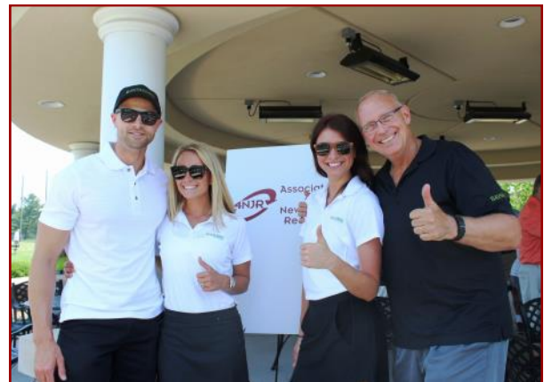
The Bayshore Recycling team is getting ready to hit the links!