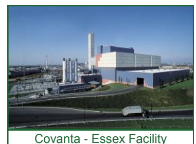
Covanta - Essex Facility