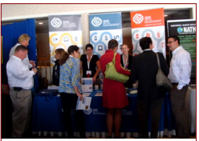
Representatives from Sims Metal Management and Sims Recycling Solutions greet many visitors to their display.