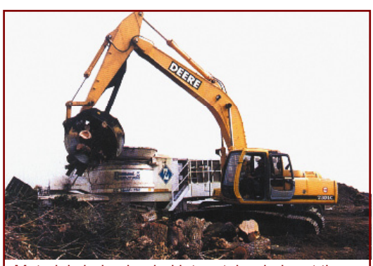
Materials being loaded into a tub grinder at the NCC Jersey City facility.

The future of organic waste recycling is just beginning. Nature's Choice and Reliable Wood are excited about opportunities that they are in the process of creating in their organization. Food waste recycling, energy production, and organic fertilization are all areas where Nature's Choice and Reliable Wood will be developing cost effective recycling processes for organic waste which will expand the uses of this material furthering the cause and need for recycling.