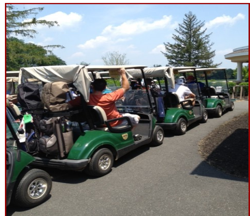
Golfers are lined up and ready to go!