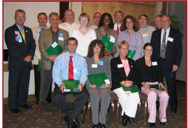
The 2005 CRP Graduating Class

Working within these guidelines will ensure that the New Jersey Recycling Certification Series maintains its status as one of the most comprehensive and respected recycling/solid waste training programs in the country. For more information, or information regarding the procedure for approval of programs for recertification credits, contact Carol Broccoli of OCPE at (732) 932-9271 ext. 618 or via e-mail at broccoli@cook.rutgers.edu .