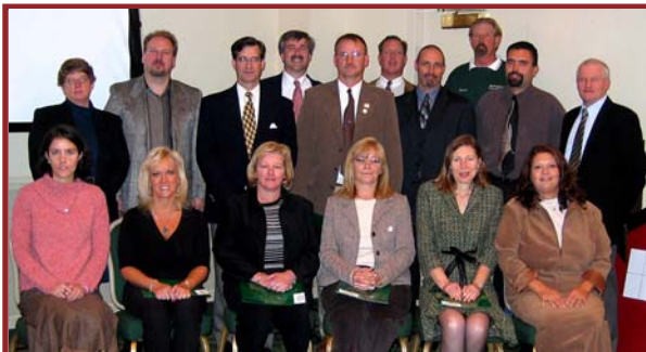
The 2004 CRP Graduating Class