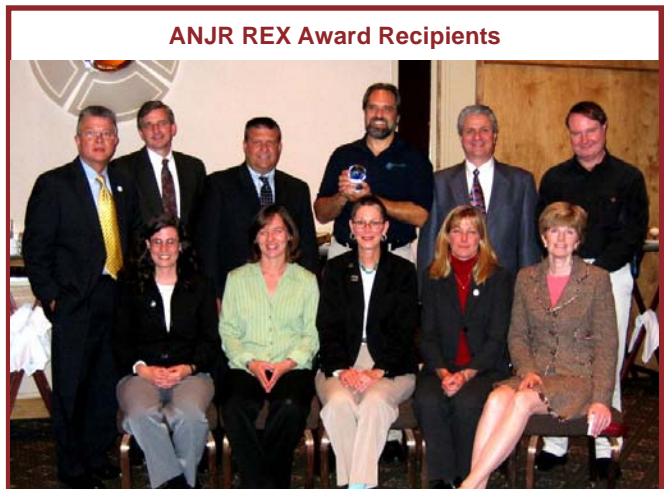
ANJR REX Award Recipients