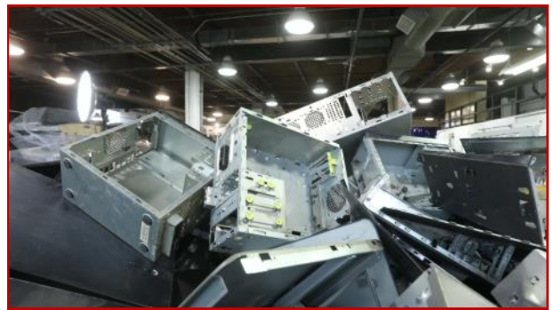
Some of the many materials that are recycled by Greenchip E-waste & ITAD Solutions.