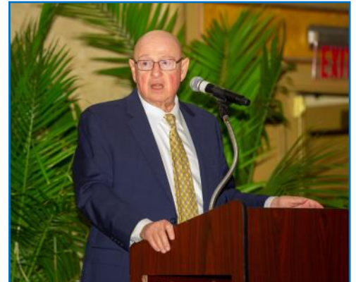
New Jersey State Senator Bob Smith (D) addresses the crowd at the 2023 NJ Sustainability in Motion Conference.